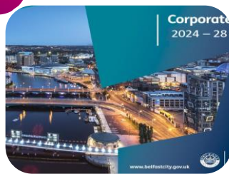
•Belfast City Council Corporate Plan 2024-2028