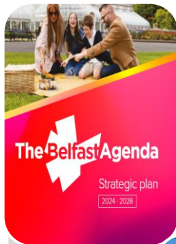
•Belfast Agenda 2024-2028

The City Growth and Regeneration Committee Plan is aligned to both the recently refreshed Belfast Agenda 2024-28 and newly developed Corporate Plan 2024-2028. It identifies the priorities that this committee will be focussed on over the year ahead and primarily relate to the 'Our economy' and 'Our place' themes. The key areas of work have been identified and specific in-year deliverables are set out in section that follows.